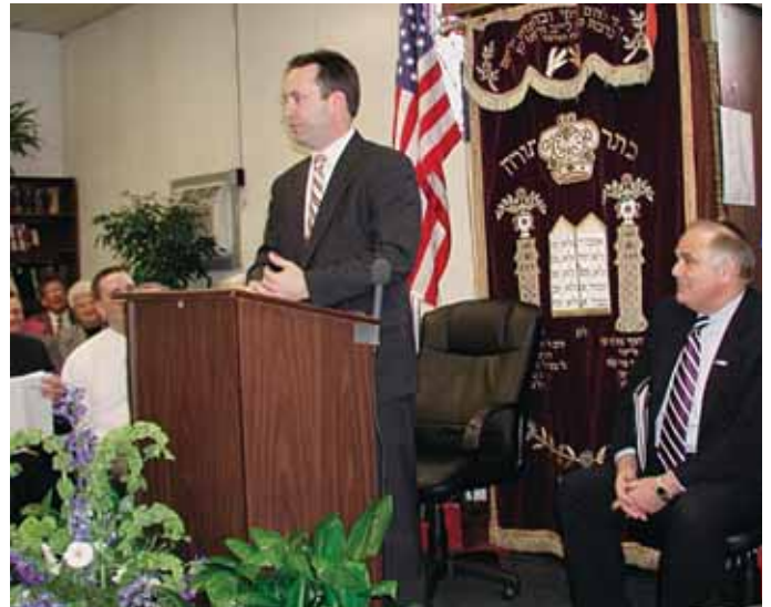
Senator Jake Corman joins Governor Edward G. Rendell in presenting $3 million in Redevelopment Assistance Capital Program (RACP) funds to the Juniata County Industrial Development Authority for infrastructure upgrades to the Empire Kosher Poultry facility in Mifflintown.

The Redevelopment Assistance Capital Program (RACP) is a Commonwealth